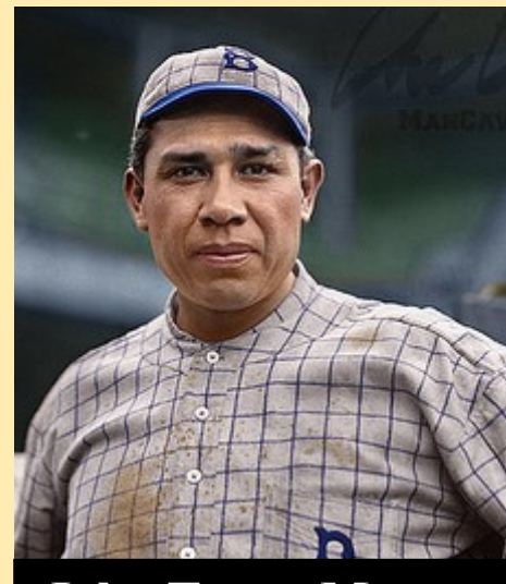
John Tortes Meyers

John Tortes "Chief" Meyers is Still another southern California American Indian veteran worth mentioning. Meyers was a Tribal member from the Santa Rosa Indian Reservation of Cahuilla Indians.